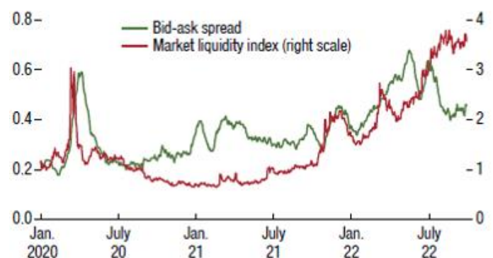
Exhibit 1: US Treasury Bid-Ask Spread and Market Liquidity Index (Basis points)

Note: The market liquidity index is the average of Bloomberg US Government Securities Liquidity index and the JP Morgan US Treasury total root mean square error (RMSE) index. IMF Global Financial Stability Report – October 2022